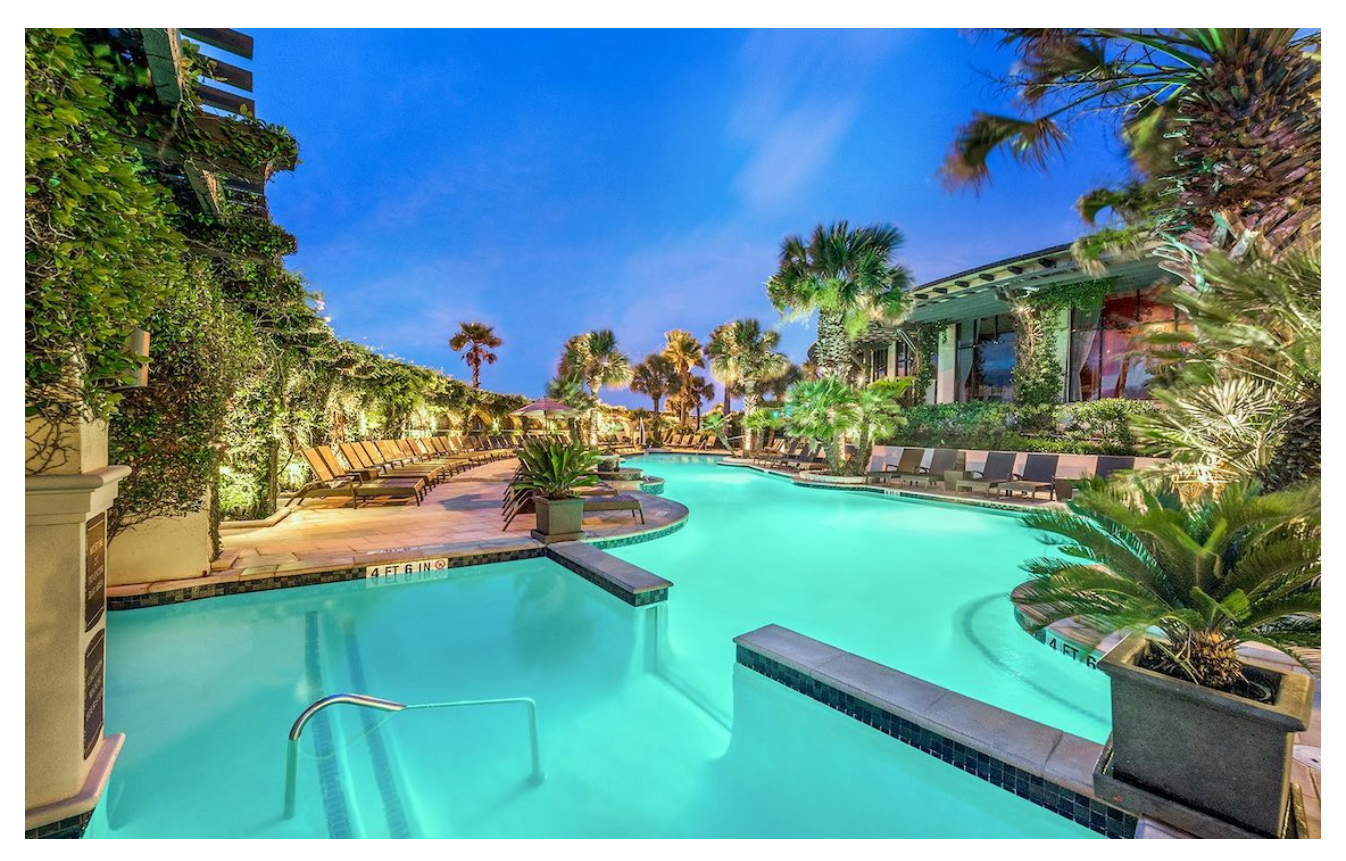
Relax in the calm waters of the pool and swim-up bar.

Last month, we were among the first to stay in one of the newly renovated rooms (pictured in the gallery above) and it perfectly blends a retro-tropical style with modern amenities, spectacular ocean views (on request) and much to our delight, plenty of monkeys. They're renovating all the hotel rooms and suites in stages, so when you visit this summer we recommend calling the hotel to make your reservation the old-fashioned way so you can specifically request one of the updated rooms.