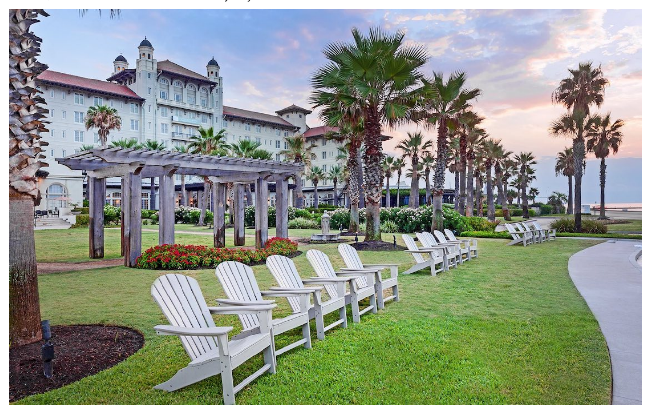
Grab a seat and watch the waves (and the people).