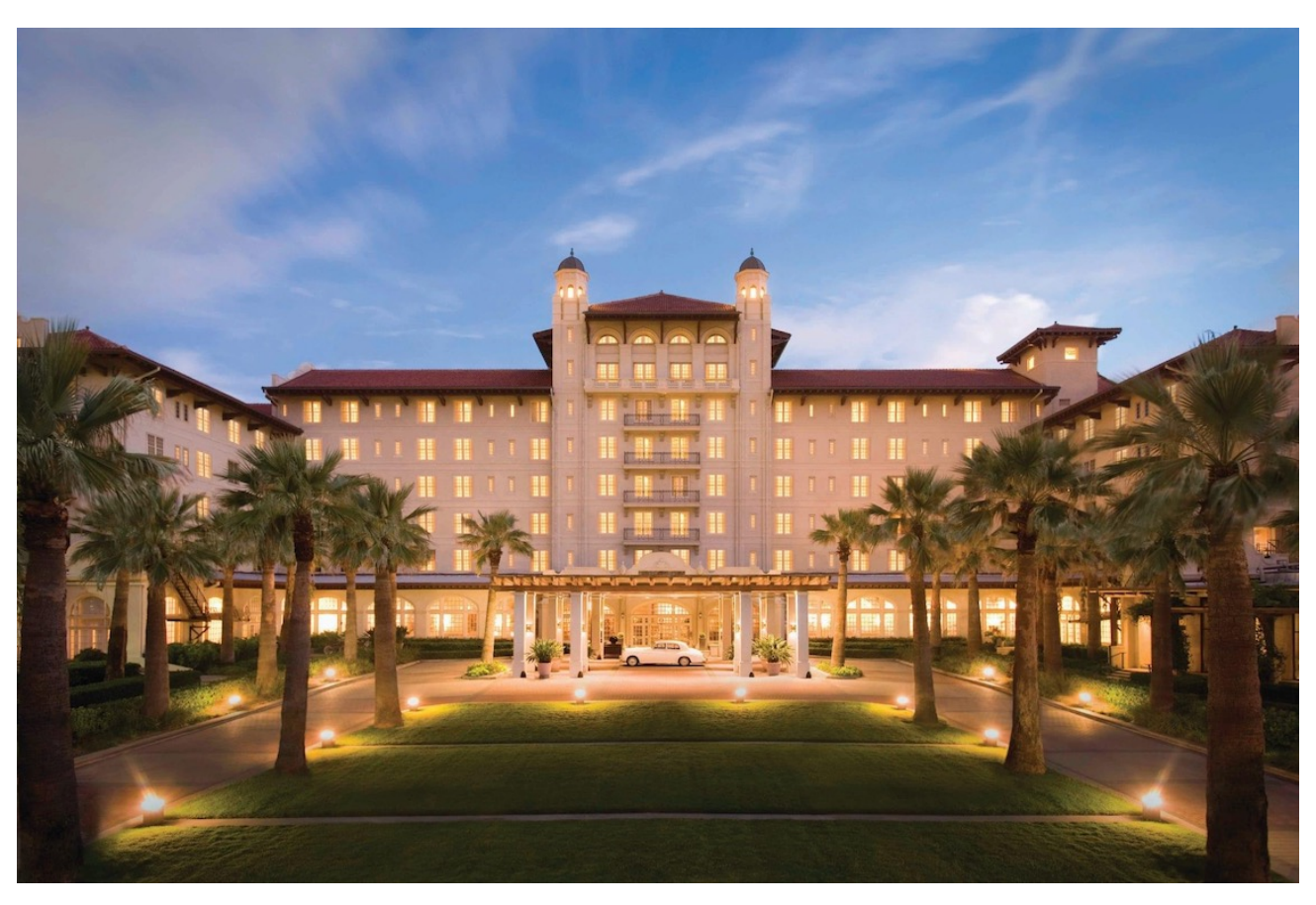
The "Queen of the Gulf" in all her majesty.